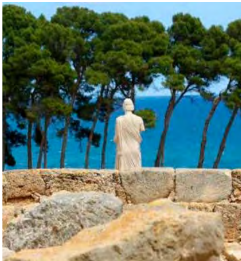
Ruins of Empúries, L'Escalà

Located in an incomparable setting, next to L'Escalà, you can visit the ruins of the Old Greek and Roman city of Empúries. Founded around 500 BC, this was the front door of these two important cultures in our peninsula.