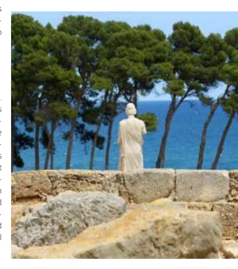
Ruins of Empuries, L'Escala

L'Escala, you can visit the ruins of the Old Greek and Roman city of Empúries. Founded around 500 BC, this was the front door of these two important cultures in our peninsula.