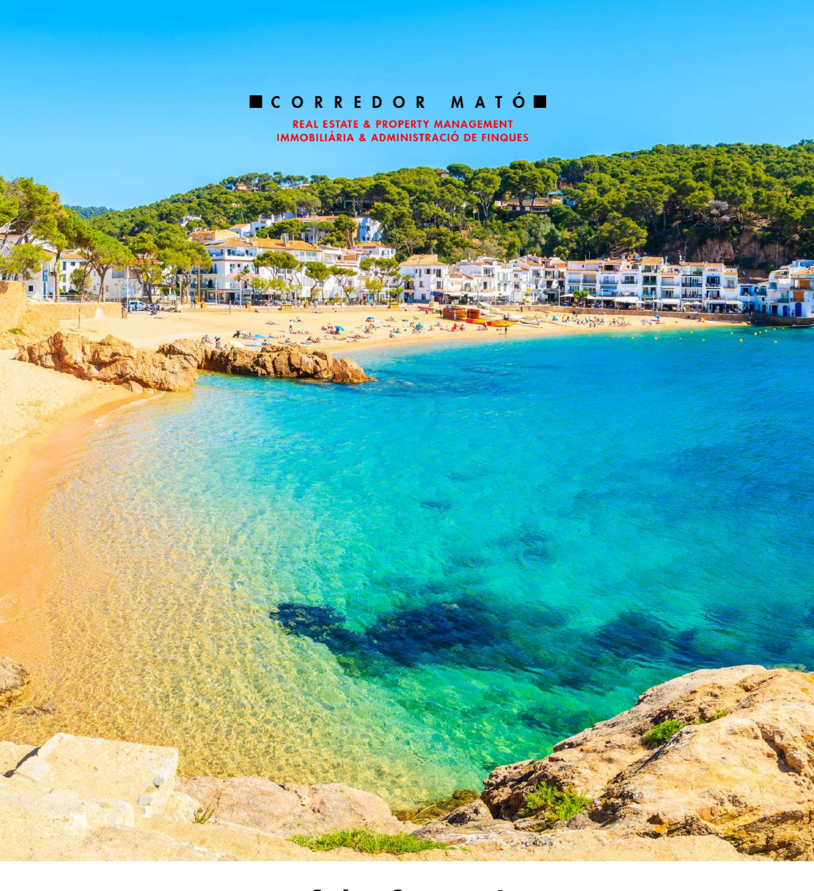
Useful Information TELEPHONES · RESTAURANTS · SPOTS

USEFUL INFORMATION Emergency Telephone Numbers