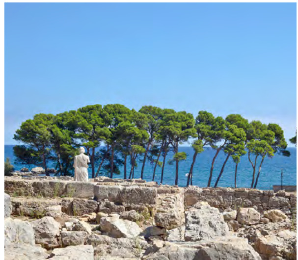
Ruins of Empúries, L'Escalà

Located in an incomparable setting, next to L'Escalà, you can visit the ruins of the Old Greek and Roman city of Empúries. Founded around 500 BC, this was the front door of these two important cultures in our peninsula.